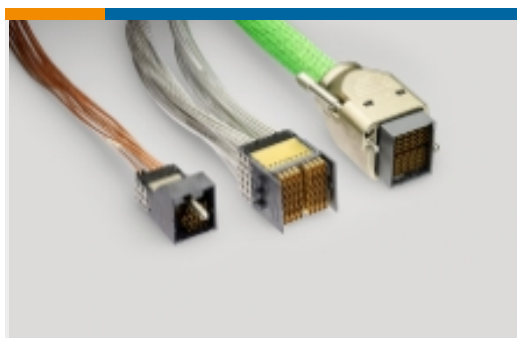
High Speed Backplane Cable Assemblies(16)