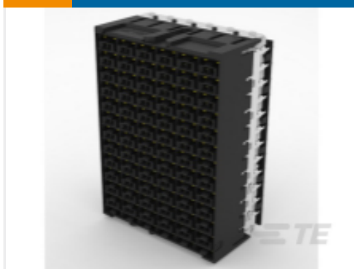
TE Part # 2187626-1 SW PIR VERT RECEPT, 100OHM, 12X6, 15MM